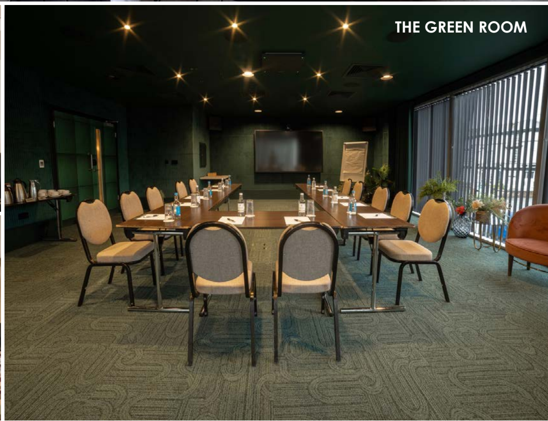
THE GREEN ROOM